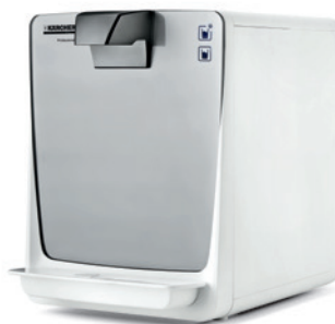
Table top version